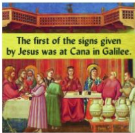
The first of the signs given by Jesus was at Cana in Galilee.

That we open our hearts and allow the Holy Spirit to work God's plan through each of us. "To each individual the manifestation of the Spirit is given for some benefit." (1 Corinthians 12:7) St. Paul tells us that God has blessed each of us for a reason. How has God blessed you? Are you using your gifts according to God's plan; helping to do His work here on earth? Remember that if you don't do the work God planned for you, no one else can do it.