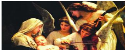
In The Sight Of Angels, I Will Sing Your Praises, Lord.