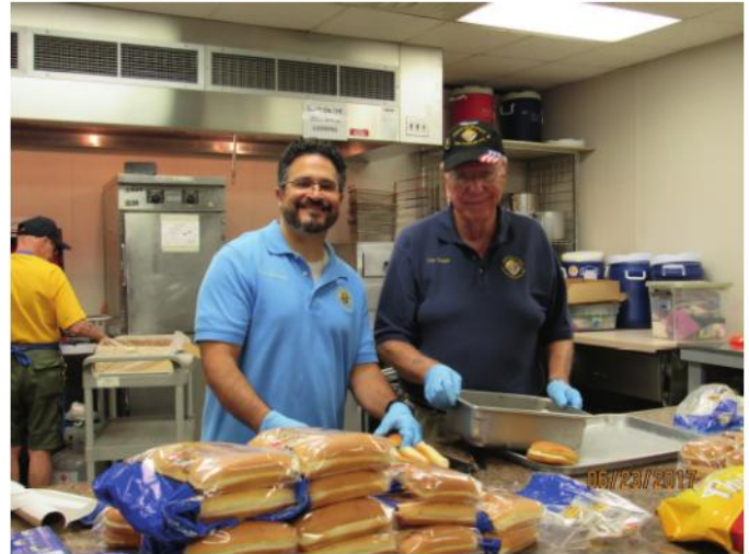
The Women of St. Michael's and Knights of Columbus sponsored the Summer Dance for the Special Populations Community