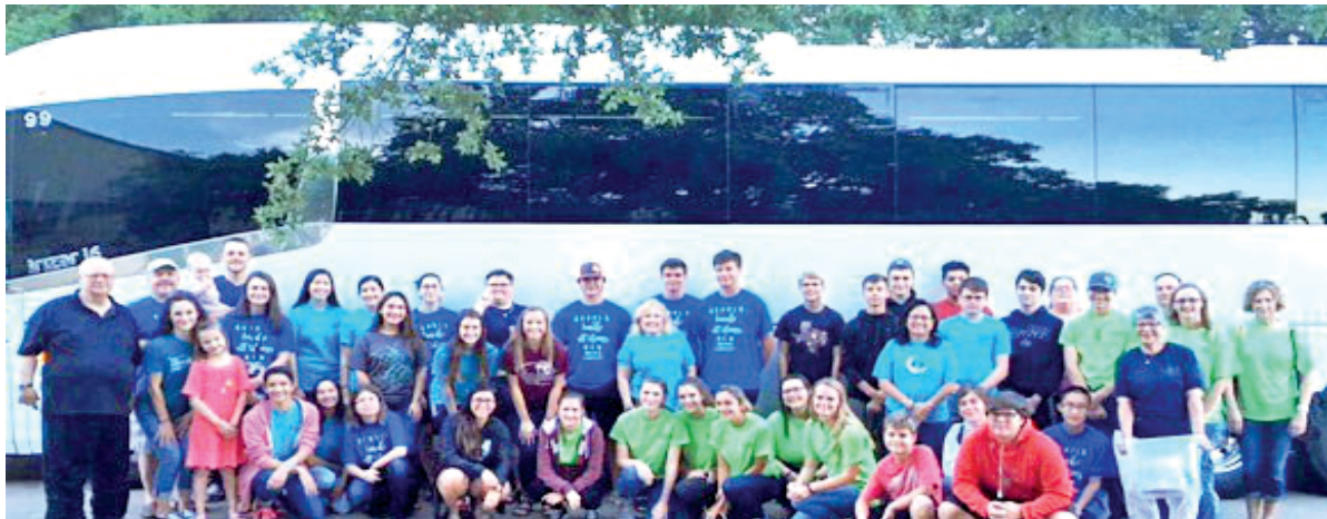
Students from St. Michael's Lake Jackson and Needville headed to Steubenville on the Bayou!

The 2018 Baby Bottle Boomerang benefitting the Pregnancy Help Center has now ended . If you still have bottles, empty or filled, please drop them off at the Pregnancy Help Center at 327 Garland Dr, Lake Jackson. Thank you for using your change to make a change.